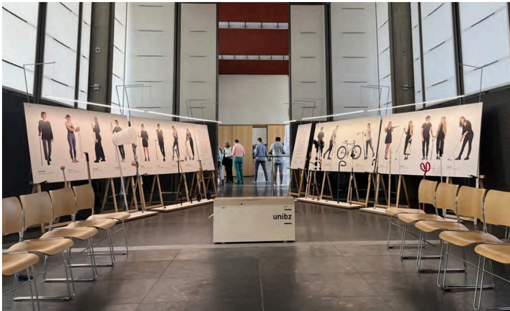
Bastoni at Munich creative Business week, May 2022

The “Bastoni” were exhibited at the Grassmesse in Leipzig in October 2021, at the MCBW in Munich in May 2022 and at the Salone Satellite – Salone Internazionale del Mobile in Milan in June of the same year. The crowning glory for a project is, of course, a design award: and “Bastoni” was awarded with the 2021 International Design Award in Tokyo by the IAUD (International Association for Universal Design) for “the outstanding achievement of BASTONI – 16 interventions of modern walking”, as well as by the IUD - Institute of Universal Design with the Gold-Award 2022 and the Expert-Award 2022.